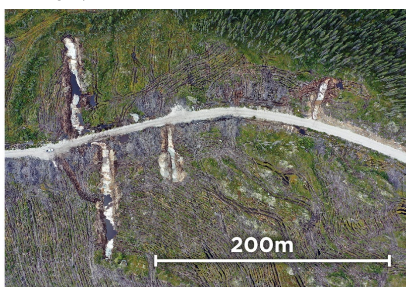
Photos above show exploration activity this summer along the Route de la Mine North Block where the new Beyan Gold Zone was identified.